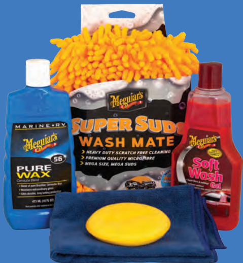
CARAVAN & RV CARE PACK | RVCARE23 | RRP $79.99